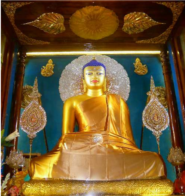
Photo: Buddha Statue at Bodhgaya, India Photograph by Sally Kelly during our 2011 pilgrimage.

email – chanacademy@bdcu.org.au web – www.bdcu.org.au