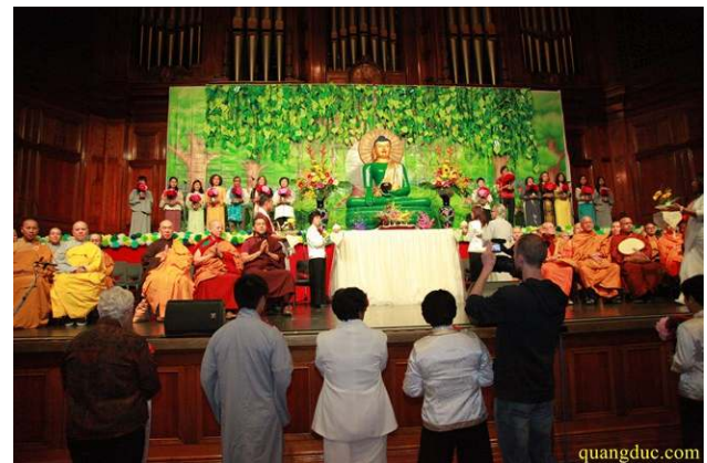
Photo: Venerable Sangha and representatives from Victorian temples during the Temple Offering Ceremony at the Victorian United Nations Day of Vesak. Photograph taken at the Melbourne Town Hall, courtesy of Quang Duc Temple.