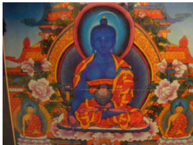
Photo: Medicine Buddha Azure Radiance Tathagata

In the Buddhist Tradition, it is said that there are many Buddhas from all across the universe. One such Buddha, named Medicine Buddha, has made vows to help beings that are sick or injured recover from their afflictions. The special healing blessings of the Medicine Buddha may be attained by reciting his name or mantra: Om Namo Bhagavati Bhaisajya Guru Vaitureya Prabha Rajaya Tatagathaya Arahati Samyaksambuddhaya Tadyata Om Bhaisajyi Bhaisajyi Bhaisajya Samudgati Svaha