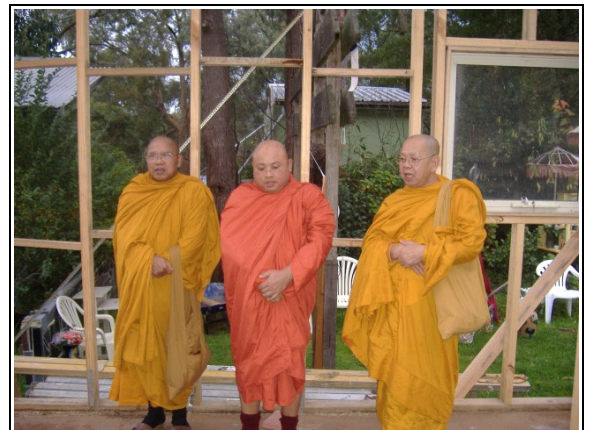
Venerable Sangha at the Centre on Versak Day 13/05/06