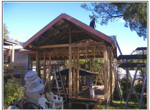
The John D. Hughes Dhamma Cetiya as of 30/05/06