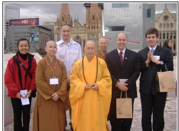
Buddha's Day and Multicultural Festival Federation Square, Melbourne 21/05/06