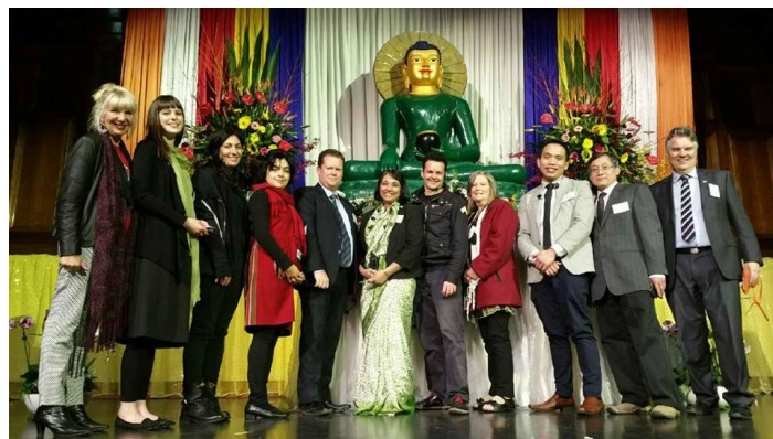
Photo: Members and Friends of our Centre at the UN Day of Vesak in 2015.

Our Centre will be assisting with logistics at the Melbourne Town Hall once again this year and your participation is welcomed.