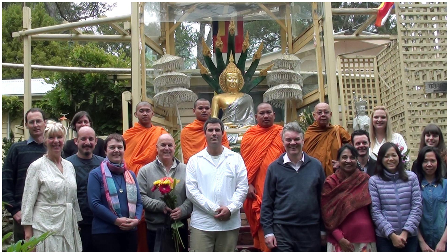
Photo: Members of the Venerable Sangha and Students from our Centre stand in front of the Buddha Rupa in our Centre's Heavenly Dhamma Garden during the 2016 Easter Bhavana Course.