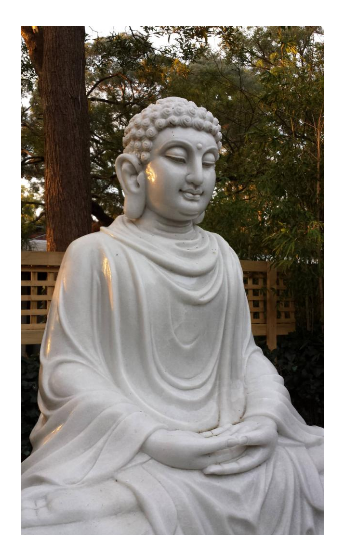
Photo: Marble Sakyamuni Buddha image in the Heavenly Dhamma Garden. Photograph taken by, Claire Ransome during sunset, Winter 2015.