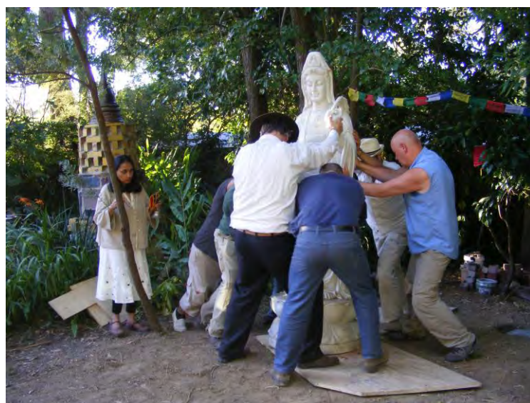
Photo: Members moving Quan Yin Statue on our Five Day Christmas Bhavana Course, Dec 2012.

The course closed with our annual fancy dress New Year’s Eve party with the theme “My Favourite Hero”. The bell puja for the New Year was performed at midnight with the sharing of the merits and metta to all beings.