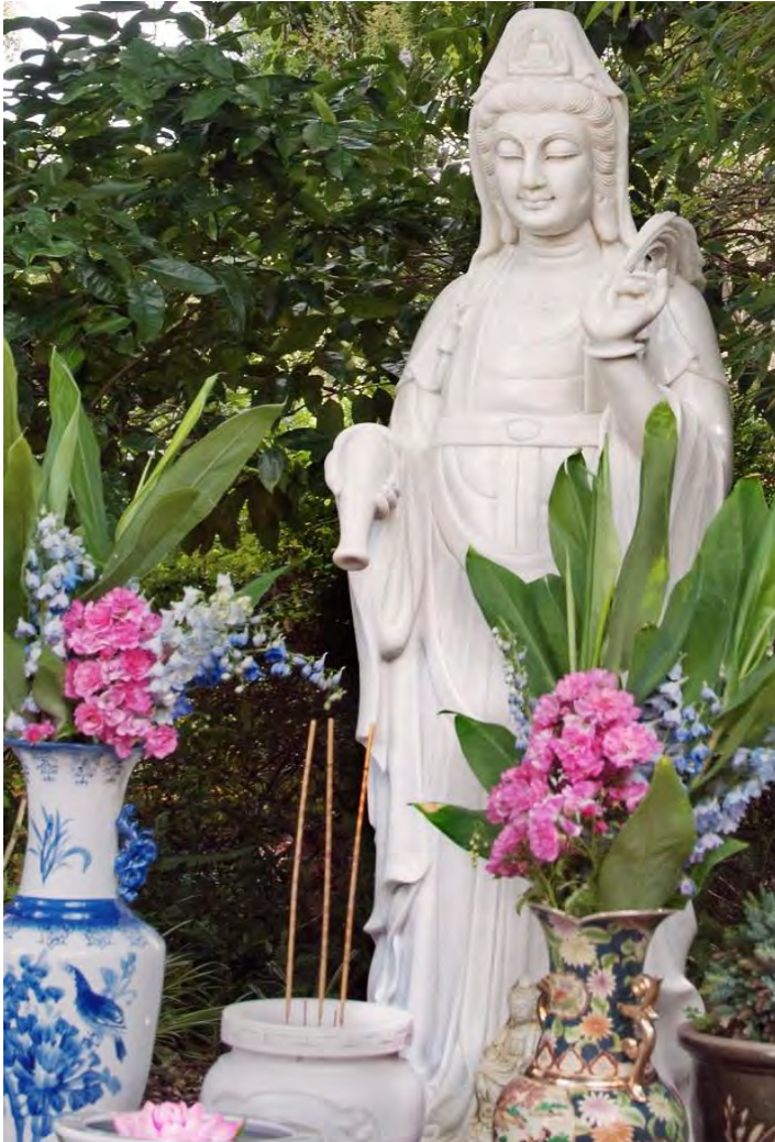
Photo: Quan Yin Statue at the Buddhist Discussion Centre Australia, January 2013.