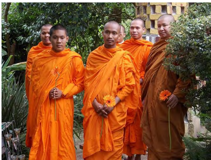
Photo: Visiting Sangha from Wat Dhammaram at the Buddhist Discussion Centre Australia, on 27 December 2012; first day of our Five Day Bhavana.

dana to six Venerable Sangha from the Wat Dhammaram Temple in Springvale.